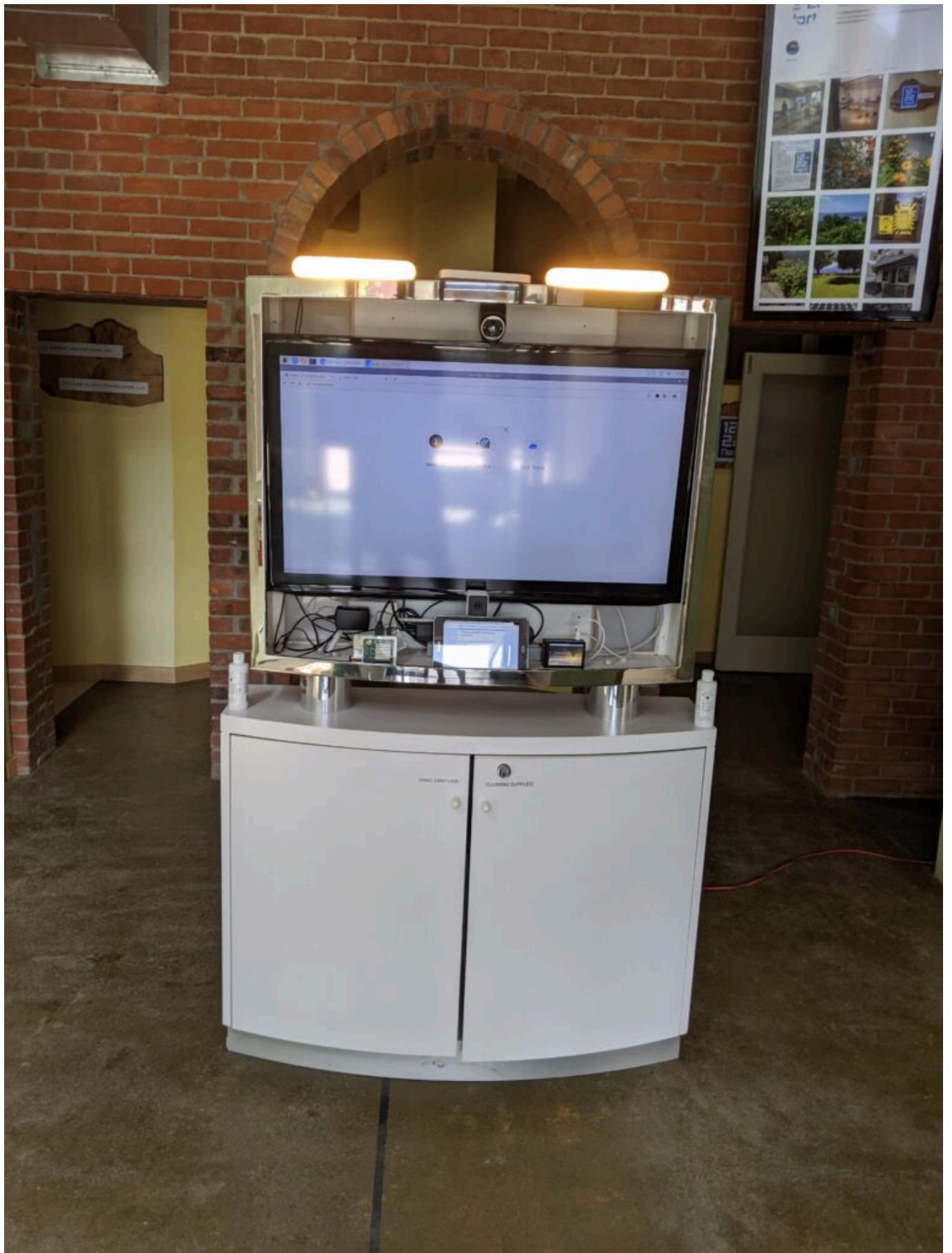
Kiosk prototype at 12-22 North